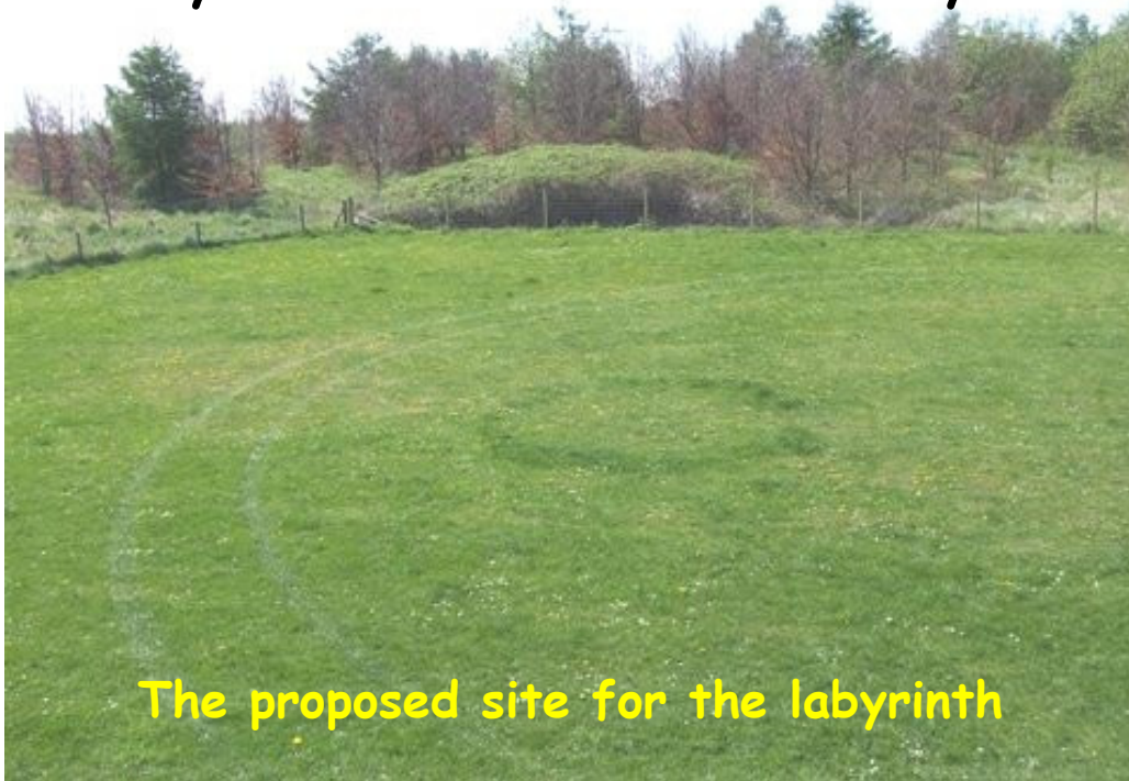
The proposed site for the labyrinth